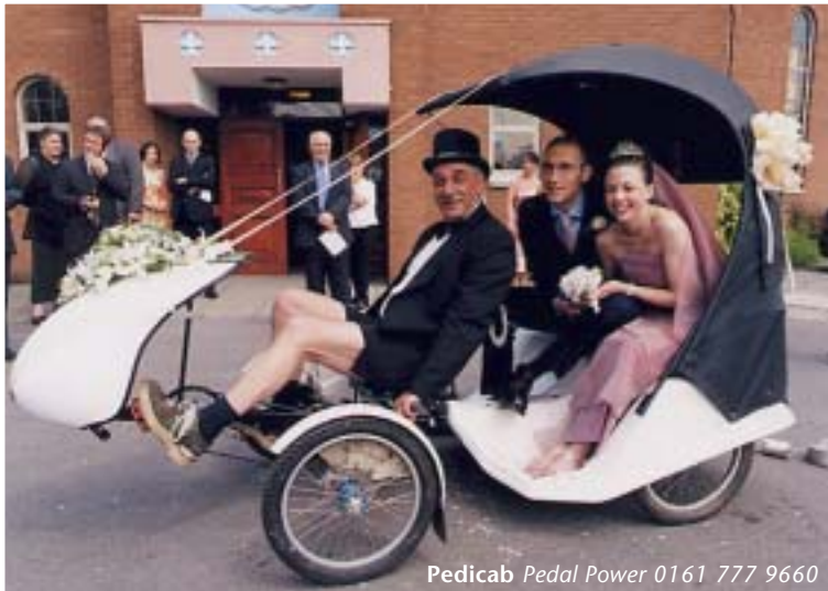
Pedicab Pedal Power 0161 777 9660